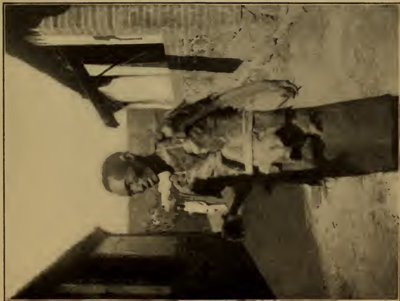
ONE OF CHINA'S PARASITES—A BEGGAR.